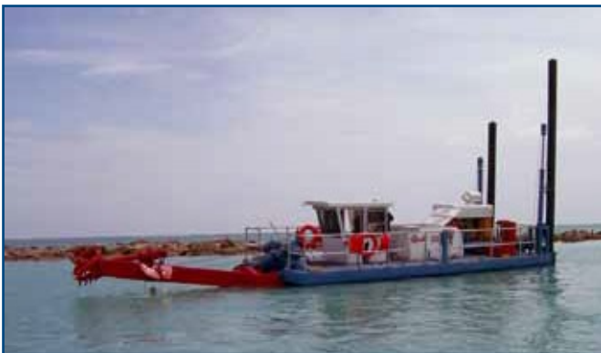
370-20 (6 m) dredging a marina