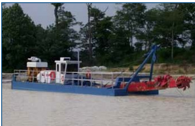
370-42 ft. (12.8 m) mining sand