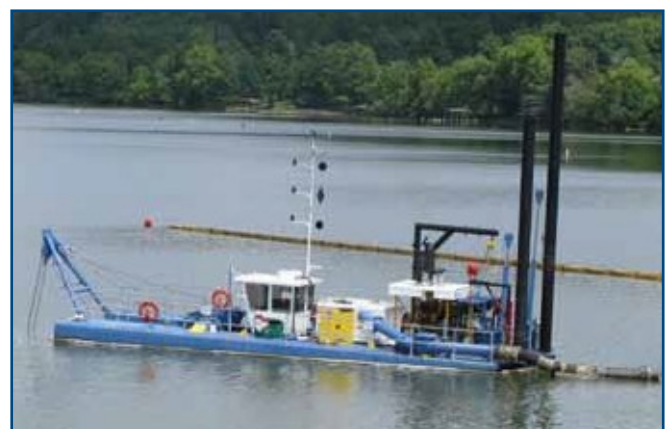
670-42 ft. (12.8 m) dredging a river