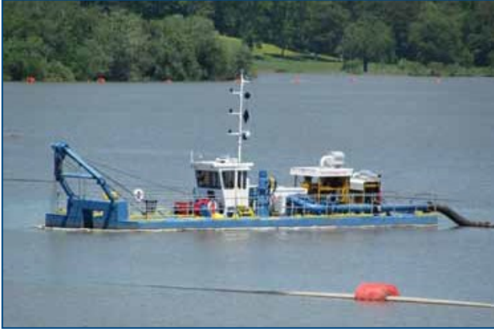
870JD 60 ft. (18 m) used for sand mining