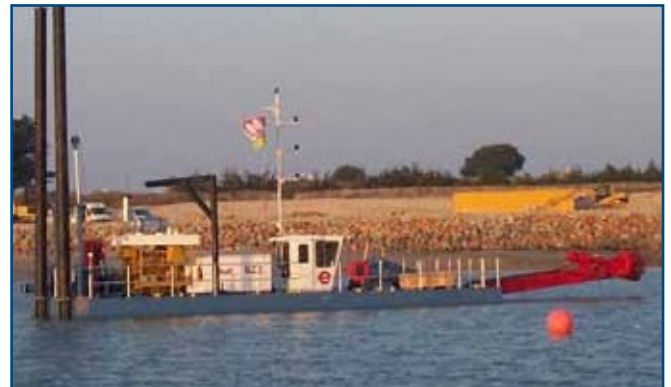
670-33 ft. (10 m) dredging small port