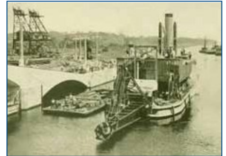
Ellicott 20" Dredge at work in Panama Canal Lock in 1913