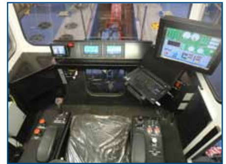
Dredge Operator Control Systems

B y 1907 the U.S. Corps of Engineers took notice and purchased four dredges for the largest construction project ever undertaken—the Panama Canal. The successful performance of these machines led to “Ellicott” becoming a name known all over the world for strong, capable, and versatile dredges.